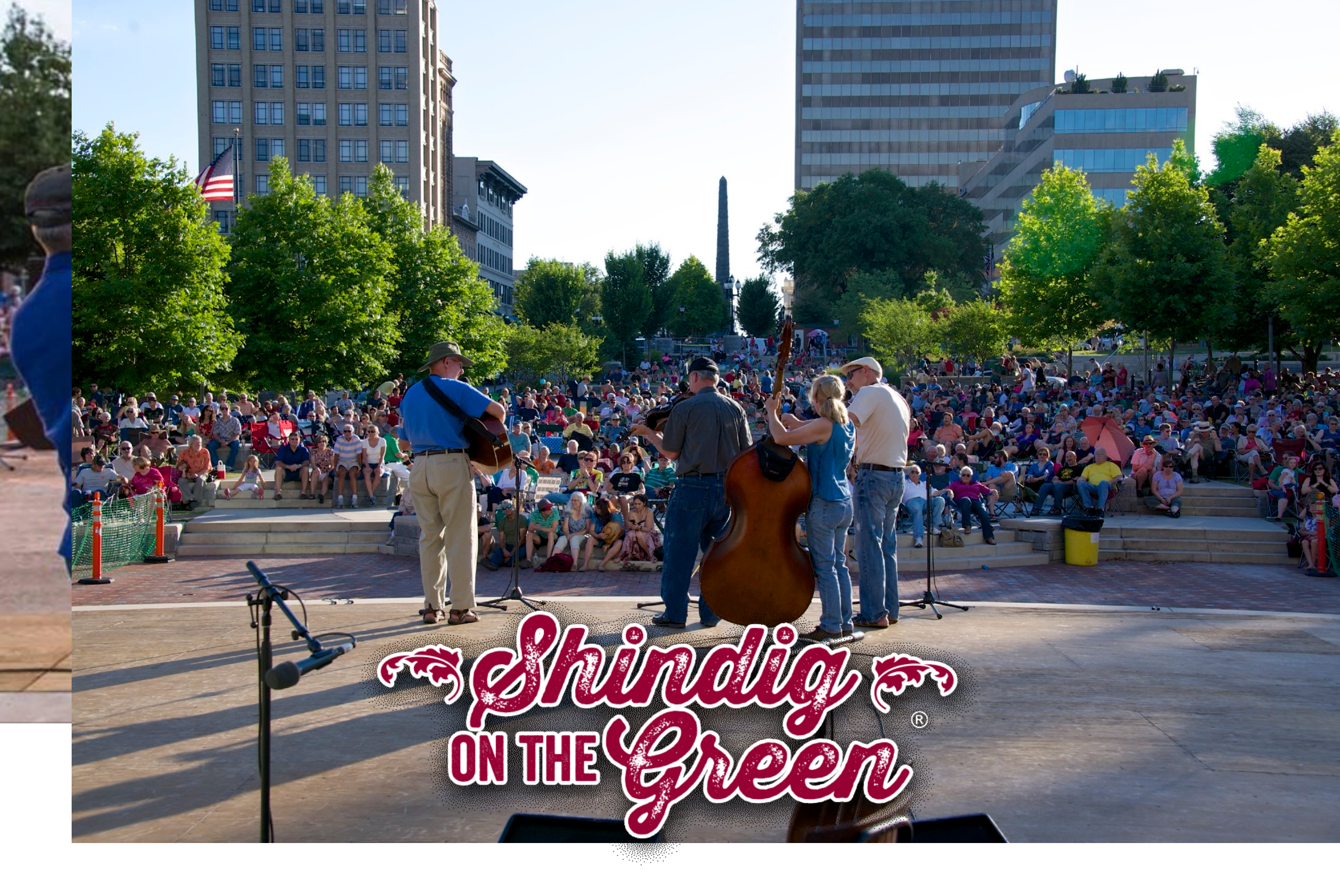
2024 Sponsorship Kit